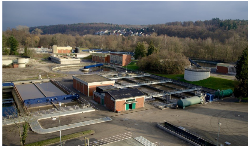
Fig. 1: Aerial view of WWTP Pforzheim in 2016

In order to ensure keeping within the prescribed nitrogen limits for the effluent, a discontinuous addition of external carbon source in the upstream denitrification zone and if necessary even in the downstream denitrification zone is mandatory in Pforzheim.